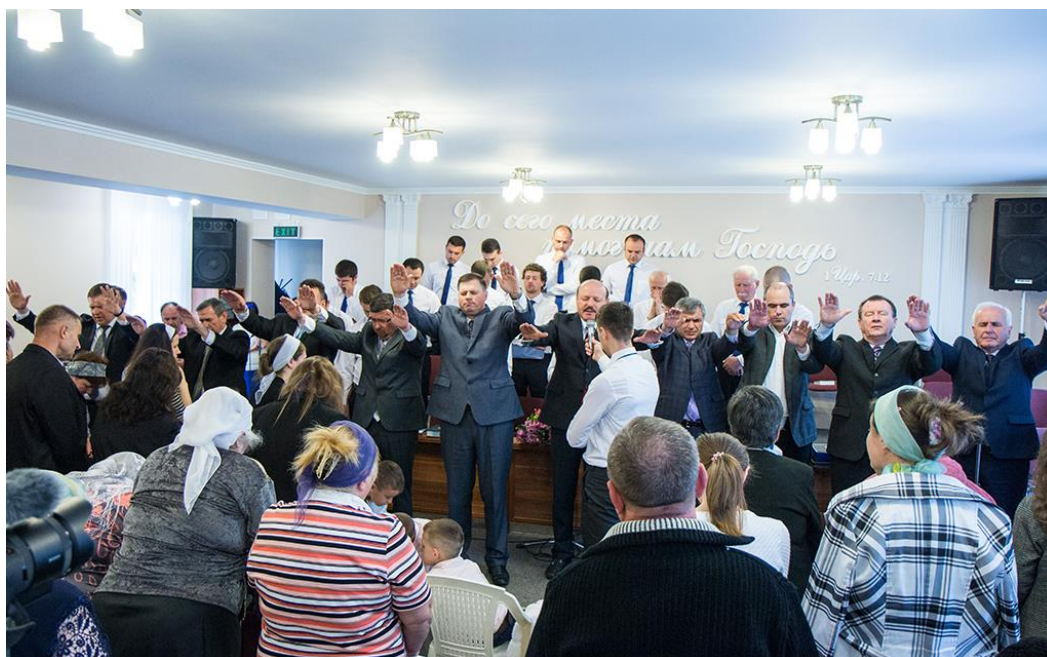
Prayer of dedication

attended by guests from different regions of Moldova. Ten pastors took part in worship and in the dedication prayer. A detailed description of this worship service can be found on the website of the Baptist Union Of Moldova, http://baptist.org.md/ru/?p=10295 .