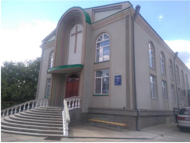
The house of prayer "Bethany" in Bendery.

On May 28 , Sunday, we again found ourselves in Transnistria. This time we visited the morning service in the church "Good News" in the city of Bendery. A few years ago, the pastor of this church died. Since then, the congregation has not had a senior pastor. The congregation is governed by three deacons who are leading the church in turn - each one for one year. I took part in that Sunday service by delivering the sermon.